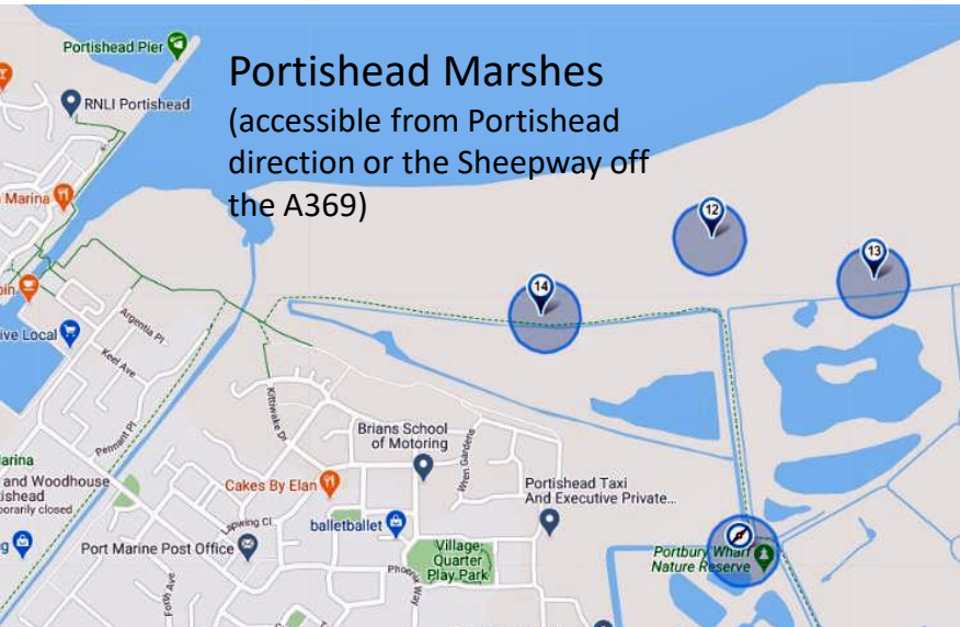
Portishead Marshes (accessible from Portishead direction or the Sheepway off the A369)

'The Outliers' (Mouth of the Avon and Portishead Marshes) are not 'guided' (no blue line to follow on your phone). Use your judgement to find these with your phone AND BEWARE OF THE TIDES, MARSHY GROUND, ROUGH PATHS ETC!